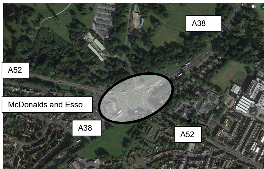
Google Image 1: Site Location in Relation to London Road and A421

1.1.3 Google Image 1 below shows the location of the site.